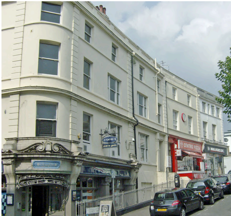
No image of the short-lived Bournemouth Youth Hostel has yet been found. The property is seen here in September 2014, on the rising Lansdowne Crescent, between O'Neill's Bar (the original Lansdowne Hotel) and Centro Pizza. It is approached by a flight of stone steps

The hostel was probably then part of the Lansdowne Hotel, though it is now a separate property.