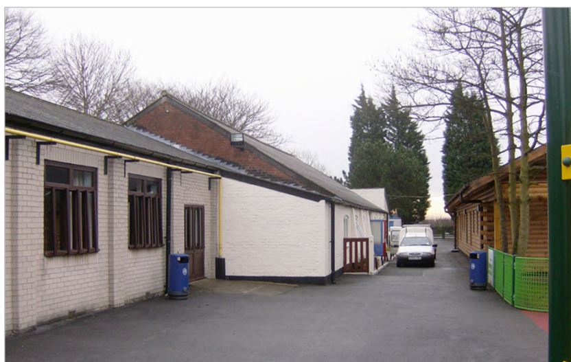
1: this view of Barnston hostel shows the accommodation huts (left) and the general facility buildings (right); 2: a more recent photograph of the Barnstondale Centre youth service facilities, including both updated and new buildings